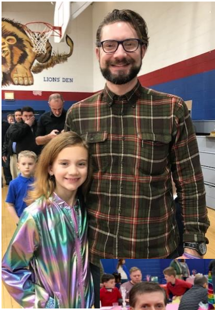
“Donuts with Dad” at BCA on Feb. 14.